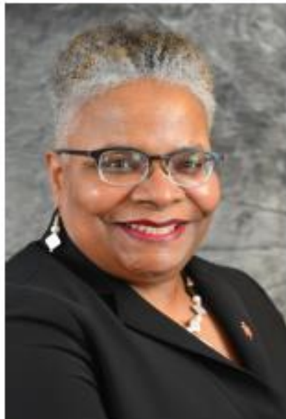
Bishop LaTrelle Easterling